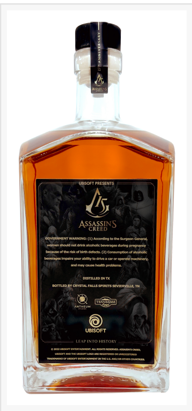
Assassin's Creed Straight Bourbon Whiskey - Back

This press release can be viewed online at: https://www.einpresswire.com/article/584617839 EIN Presswire's priority is source transparency. We do not allow opaque clients, and our editors try to be careful about weeding out false and misleading content. As a user, if you see something we have missed, please do bring it to our attention. Your help is welcome. EIN Presswire, Everyone's Internet News Presswire™, tries to define some of the boundaries that are reasonable in today's world. Please see our Editorial Guidelines for more information. © 1995-2022 Newsmatics Inc. All Right Reserved.