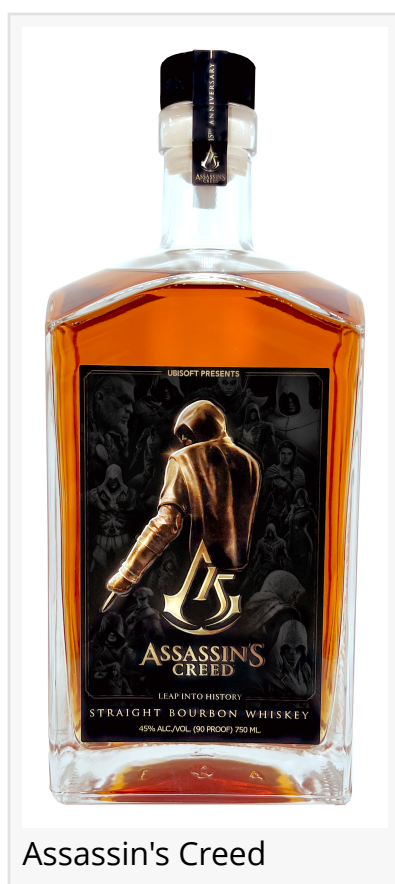
Assassin's Creed Straight Bourbon Whiskey - Front