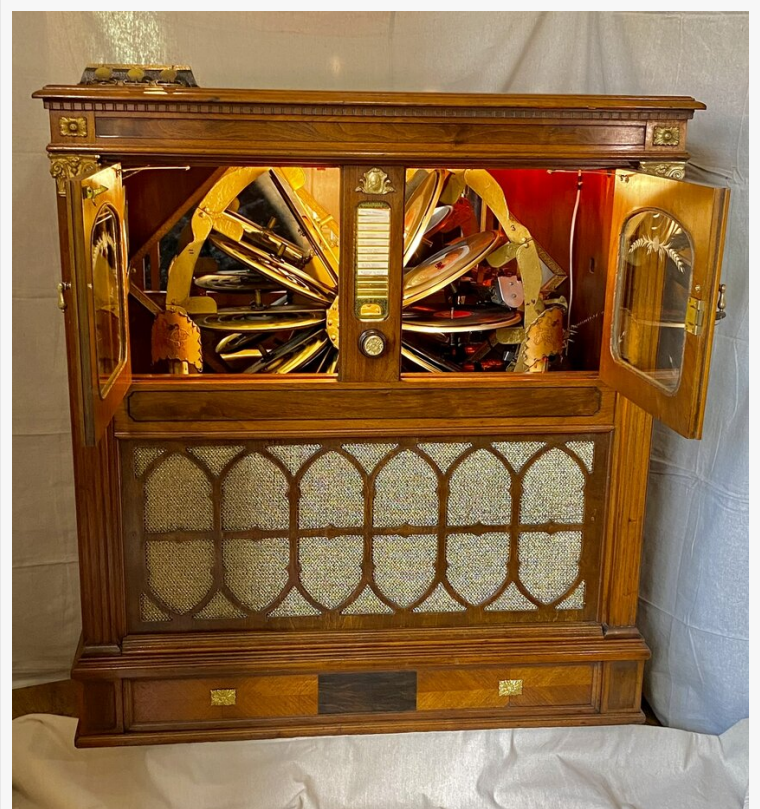
Mills Troubadour jukebox in pristine condition, acquired from the now-defunct Enrico Caruso Museum of America in Brooklyn, N.Y.

There are thirteen vintage Wurlitzer jukeboxes (all playing 78 rpm records) that collectors covet, and this auction has many of them, all beautiful and in excellent condition. They include not one