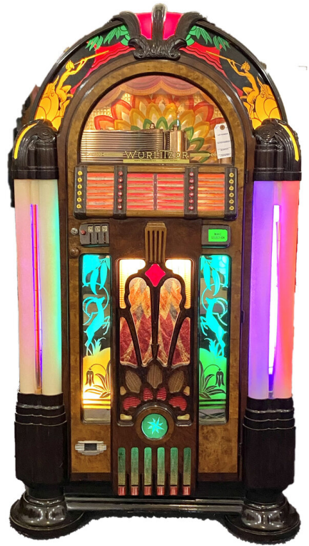
Wurlitzer model 950 jukebox, perhaps the rarest and most desirable of all the Wurlitzers.