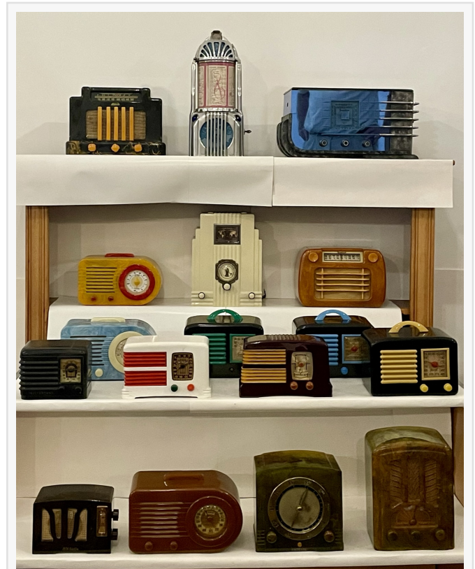
A nice selection of Catalin tube radios from the 1930s, to include these shown, will be sold.

Preston Evans Preston Opportunities +1 678-296-3326 email us here