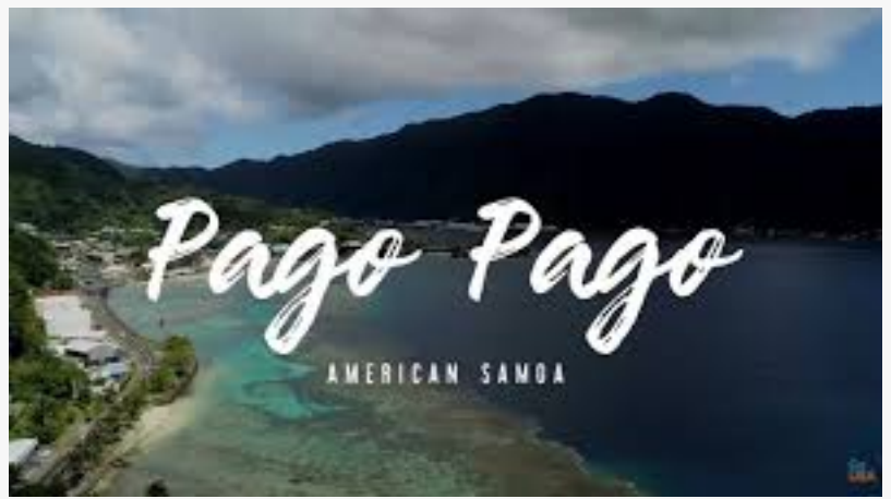
Pago Pago, American Samoa