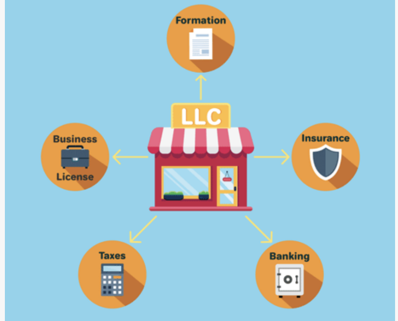
Set up an Anonymous LLC