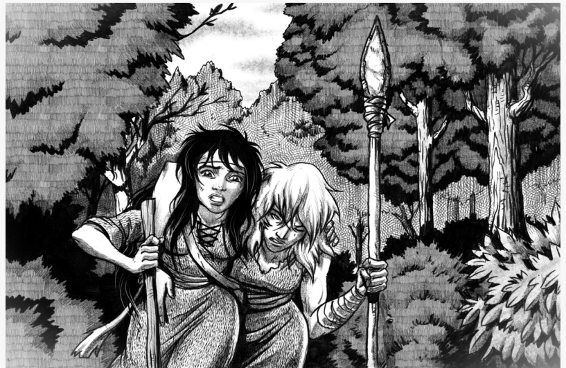
The protagonist of The Final Days of Doggerland by Mike Meier