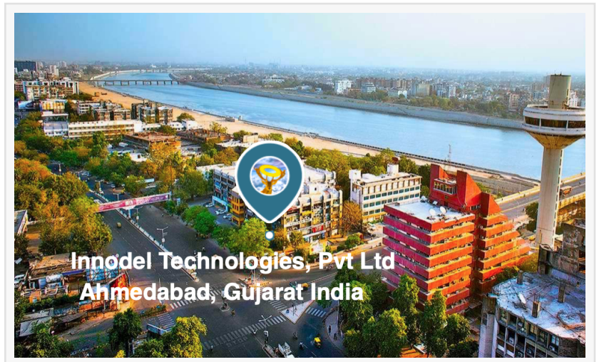
Development partner, Innodel Technologies in Ahmedabad, India.

https://www.wiseidiot.com/best-citiesto-live-in-india/, as the 3rd best city to live in India. Roadkill Art located in Charleston, South Carolina, a city voted the best to live in the United States by,