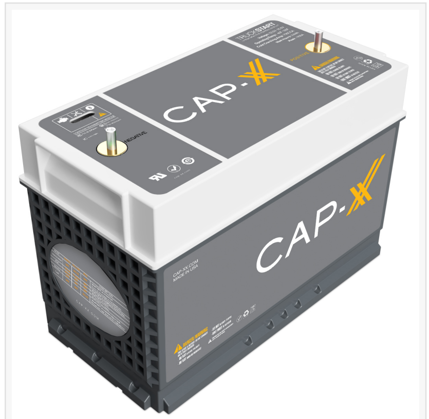
The Ioxus uSTART truck start modules will be branded CAPSTART for CAP-XX sales efforts in EMEA, APAC, Mexico, Central and South America, Australia and New Zealand.

electronics applications where small energy storage device size and thickness are critical. Visit https://www.cap-xx.com/ or email sales@cap-xx.com .