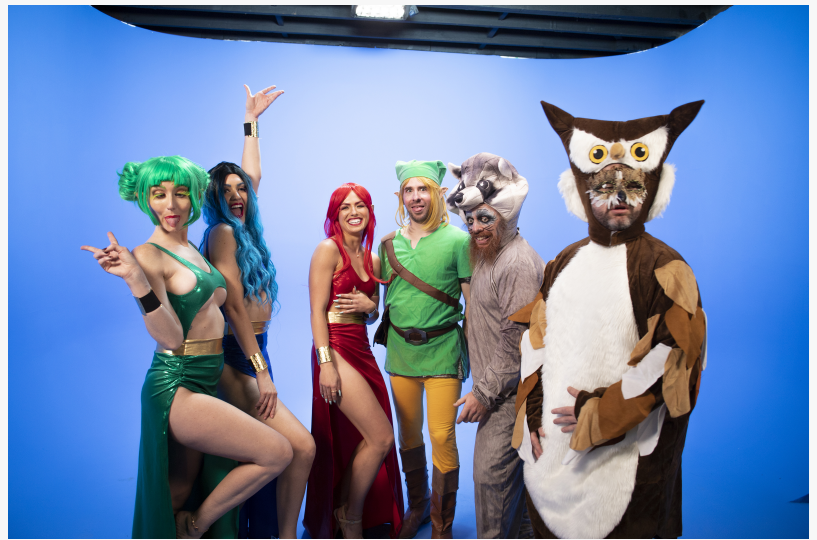
Full Cast Happy Faces

This press release can be viewed online at: https://www.einpresswire.com/article/584902501 EIN Presswire's priority is source transparency. We do not allow opaque clients, and our editors try to be careful about weeding out false and misleading content. As a user, if you see something we have missed, please do bring it to our attention. Your help is welcome. EIN Presswire, Everyone's Internet News Presswire™, tries to define some of the boundaries that are reasonable in today's world. Please see our Editorial Guidelines for more information. © 1995-2023 Newsmatics Inc. All Right Reserved.