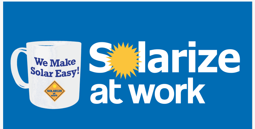
Solarize at Work