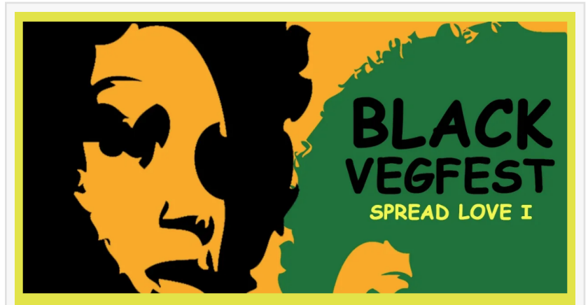
Black VegFest Spread Love I Picture

This press release can be viewed online at: https://www.einpresswire.com/article/584946766