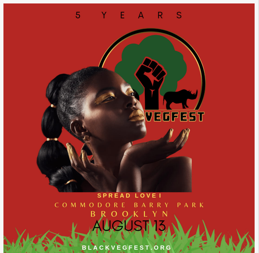
Black VegFest Spread Love I Flyer