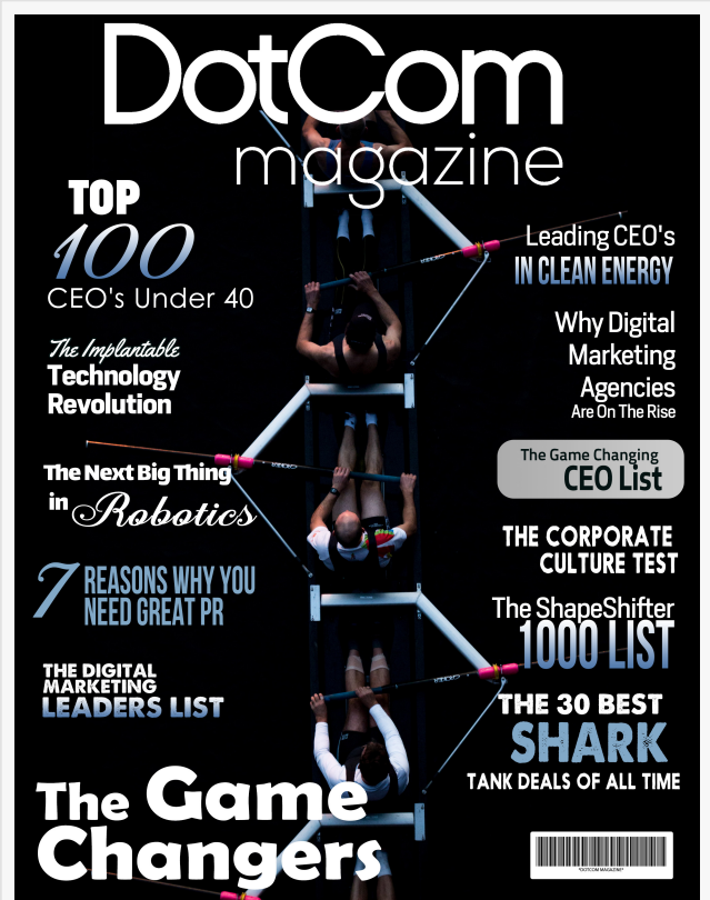
The DotCom Magazine Game Changers Edition