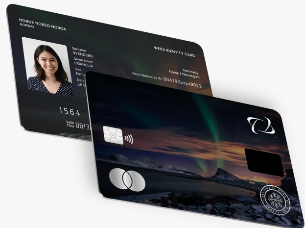
Reltime Web3 Cold Storage Payment and ID Card