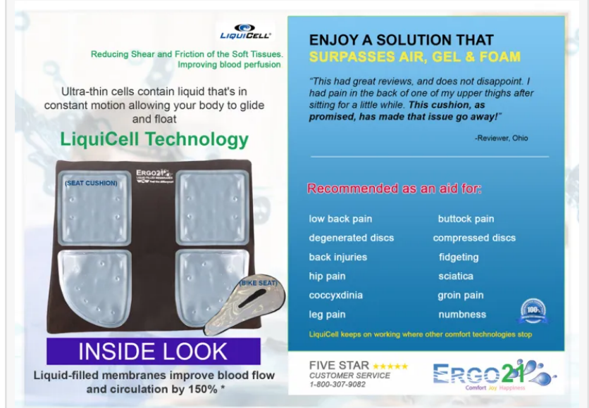
Original Comfort Seat Cushion