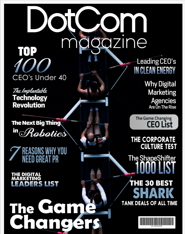
The DotCom Magazine Game Changers Edition