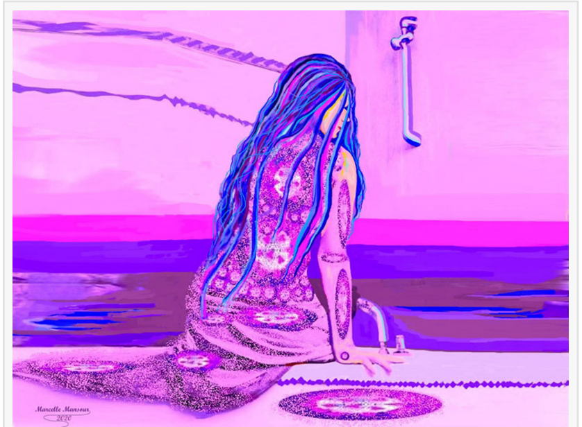
Stay Sane during Quarantine Isolation by Marcelle Mansour

This press release can be viewed online at: https://www.einpresswire.com/article/585043424