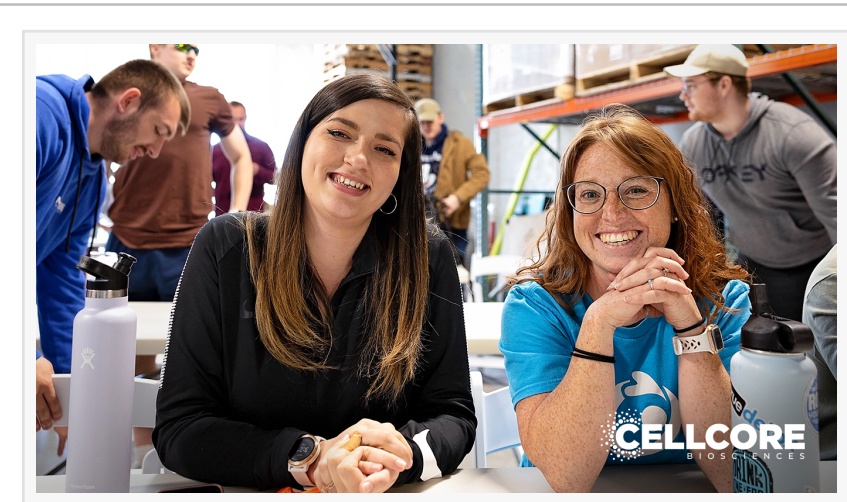
CellCore Ranked in Top 10 Wellness Startups

MERIDIAN, ID, UNITED STATES, August 8, 2022 /EINPresswire.com/ -- CellCore Biosciences has been recognized as a top 10 business in the 101 Best Idaho Wellness Companies and Startups by Best Startups. This website has set out to "promote the greatest American companies, businesses, and innovations on the global stage," and