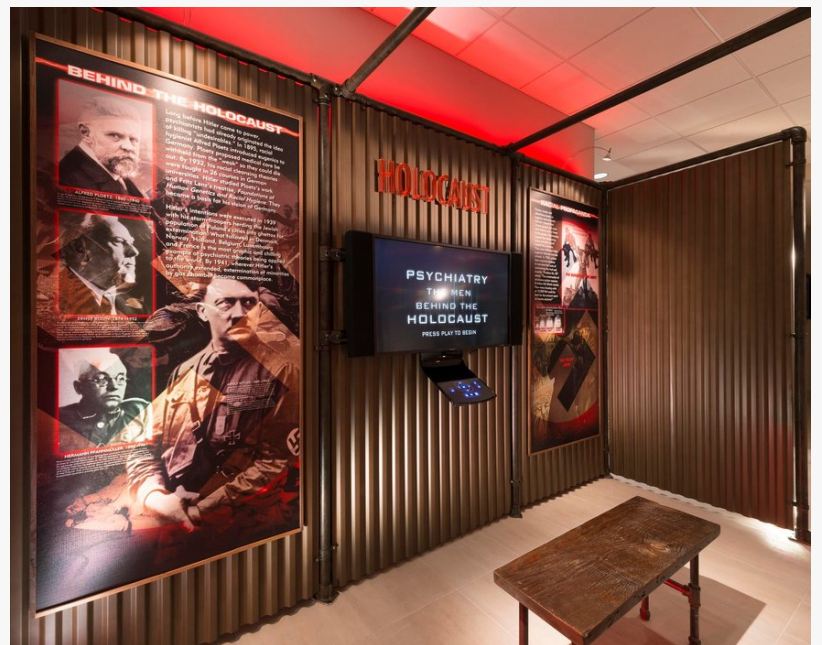
The Psychiatry: An Industry of Death museum is open daily in downtown Clearwater, Florida