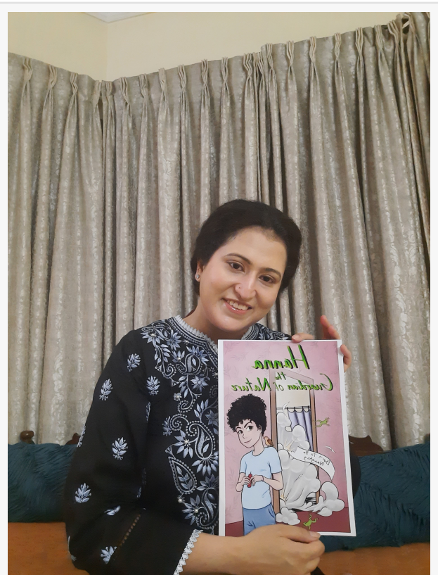
Book cover and Author

https://www.kobo.com/us/en/ebook/born-to-be-naughty