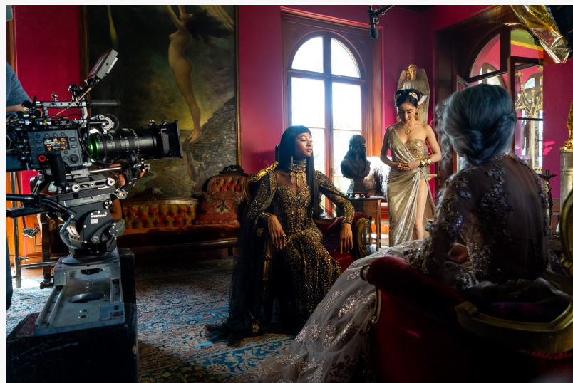
Time is Eternal Behind The Scenes 2 - Photo Credit Christopher Scott

This press release can be viewed online at: https://www.einpresswire.com/article/585437845