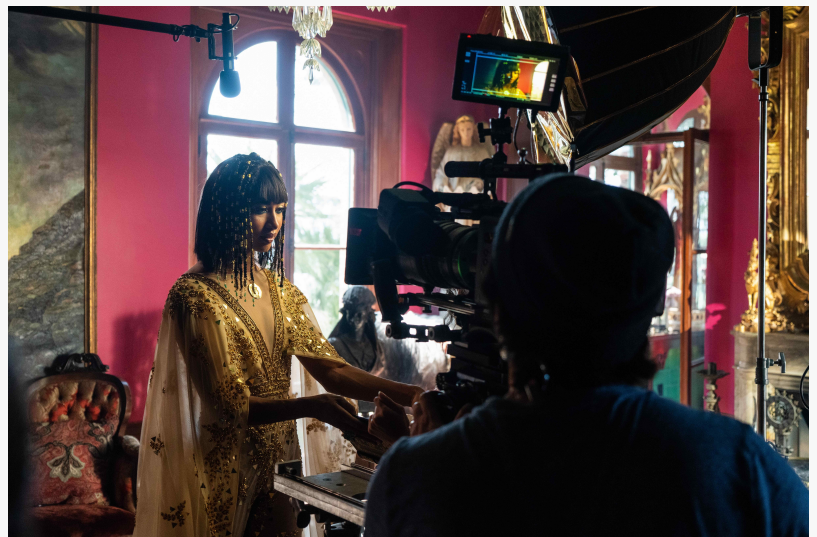
Time is Eternal Behind The Scenes