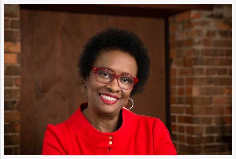
Senator Arthenia Joyner of Swope, Rodante P.A.