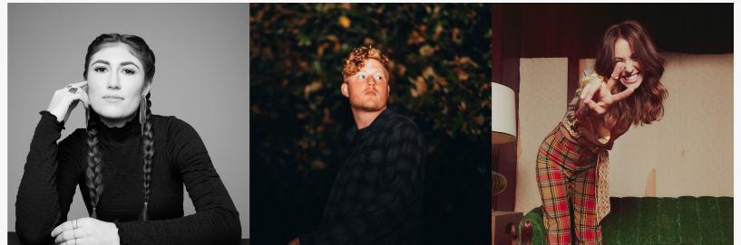
Pictured (l-r) are Katy Nichole, Chris Renzema and Lauren Daigle.