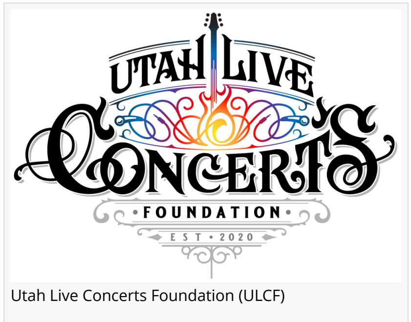
Utah Live Concerts Foundation (ULCF)

OREM, UTAH, US. , August 10, 2022 /EINPresswire.com/ -- Utah Live Concerts Foundation (ULCF) in conjunction with Orem City today announced the merger of its popular Come Together music festival with the Orem Classic Car show sporting more than 30 classic cars. The Spry sponsored festival rocks Orem August 19-20 in Orem City Center Park. The Classic Car show happens Saturday noon to 4pm in the park. In its third year, ULCF events have attracted bands from the western U.S. to entertain more than 8,000 fans in free, family-friendly venues. VIDEO