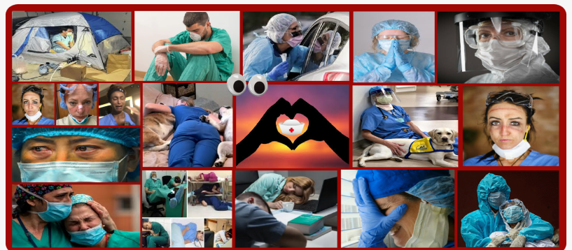
Operation Scrubs honors nurses - Covid 19's unsung frontline heroes.