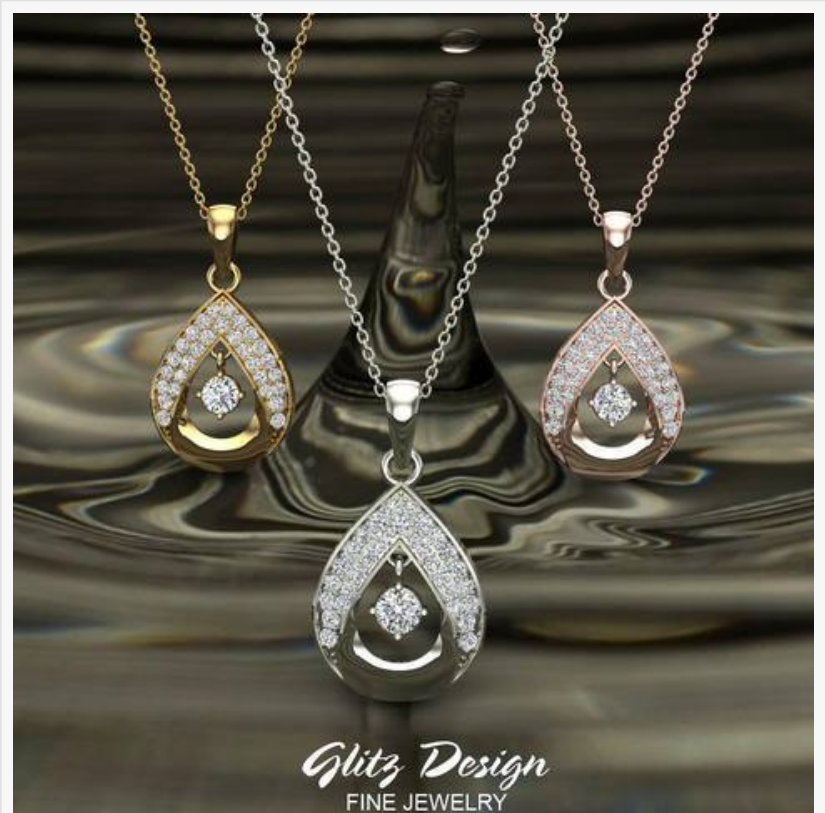
Teardrop Style Artistic Diamond Necklace for inspiration