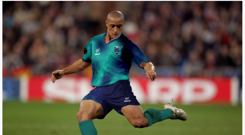
Roberto Carlos soccer legend and StarCard Sport Games Ambassador