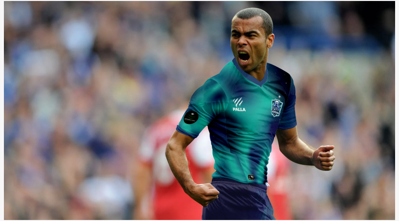
Ashley Cole soccer legend and StarCard Sport Games NFT Ambassador

Recently ARC released its cooperative NFT marketplace which partners with innovative features