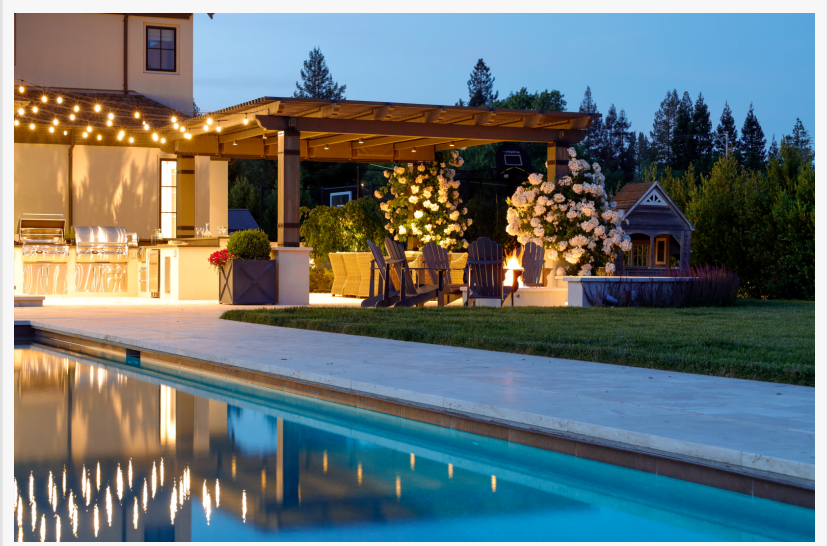
Nightscape backyard with pergola, firepit, outdoor kitchen and custom pool.

swimming, growing vegetables, etc.) Are there existing areas on your site where you know you want some of these activities to take place?