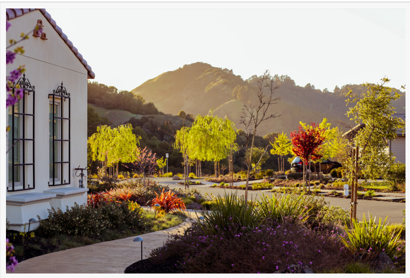
Front yard colorful planting and pathway with sweeping greenery.

How do you see yourself using your future landscape? (Outdoor dining,