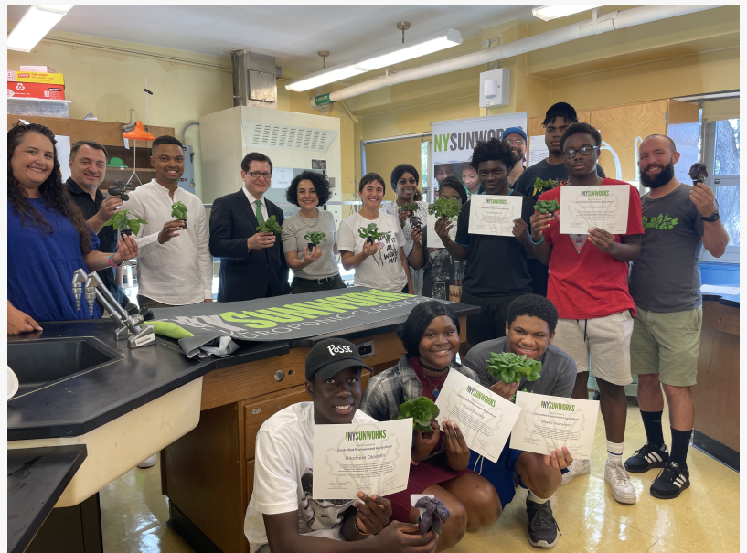
Graduates pose with NY Sun Works staff and school leadership.

NY Sun Works developed the program, which is the first of its kind in NYC, with funding from the U.S. Department of Agriculture, in collaboration with the city's Summer Youth Employment Program (SYEP). The program addresses the need for youth workforce development programs, especially for students in underserved communities, and helps build a pipeline of skilled workers in hydroponic farming, a growing green industry in NYC and other urban areas. "Giving students hands-on opportunities with hydroponics is critical to improve their physical health, mental wellbeing, and career readiness," said Mayor Adams. "As Brooklyn borough president, I was