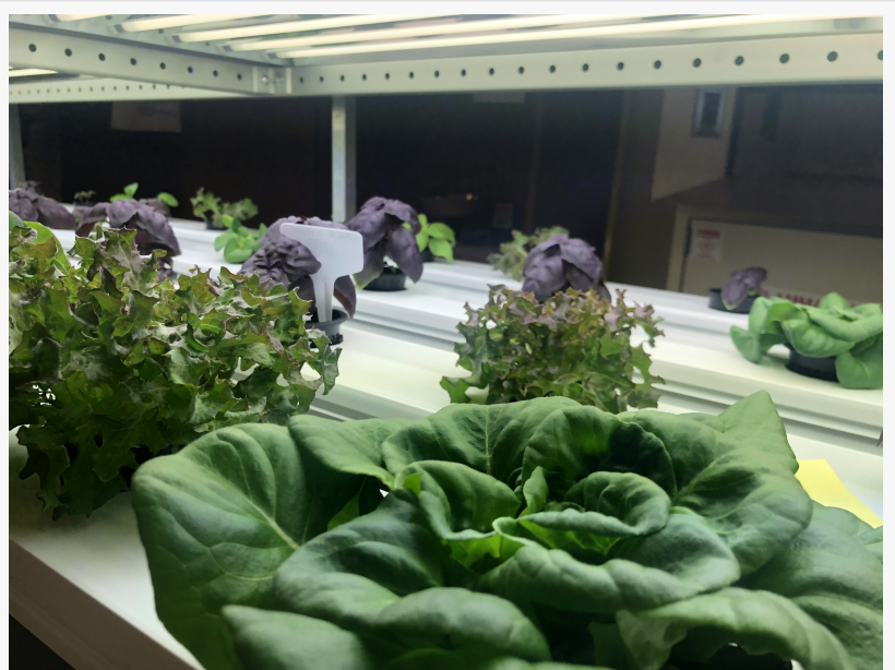
Leafy greens growing in K617's hydroponic classroom.

with standard troubleshooting techniques. Additionally, students gained key experience in managing water quality, performing nutrient testing and solving nutrient deficiency, and implementing pest prevention. Over the course of their six-week program, the students completed routine practical assessments pertaining to these skills to ensure their certification prepared them for their graduation. In addition, students gained important job readiness skills through tasks such as mock interviews that will help equip them for the transition into the workforce.