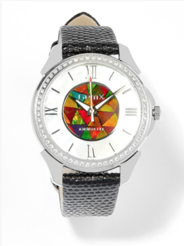
GEMXX Mosaic Ammolite & Sapphire Watch