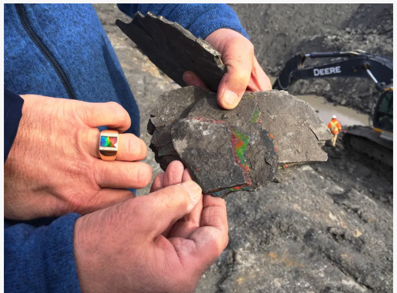
Gold Ammolite ring and fresh rough from mine

This press release contains forward-looking statements that can be identified by terminology such as "believes," "expects," "potential," "plans," "suggests," "may," "should," "could," "intends," or similar expressions. Many forward-looking statements involve known and unknown risks, uncertainties and other factors that may cause actual results to be materially different from any future results implied by such statements. These factors include, but are not limited to, our ability to continue to enhance our products and systems to address industry changes, our ability to expand our customer base and retain existing customers, our ability to effectively compete in our market segment, the lack of public information on our company, our ability to raise sufficient capital to fund our business, operations, our ability to continue as a going concern, and a limited public market for our common stock, among other risks. Many factors are difficult to predict