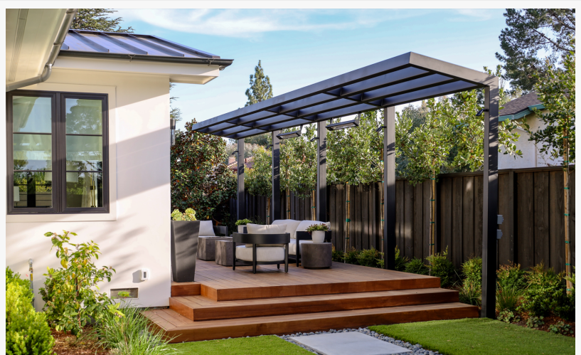
This backyard contains epi wood decking with a black metal L arbor and synthetic turf.

ALAMO, CA, USA, August 22, 2022 /EINPresswire.com/ -- Here at J. Montgomery Designs , we are always excited about new things, especially when they relate to Landscape Architecture, so contemporary landscaping has truly stolen our hearts. Here are a few of our favorite contemporary elements we use in designing landscapes that stun with their simple and innovative modern style.