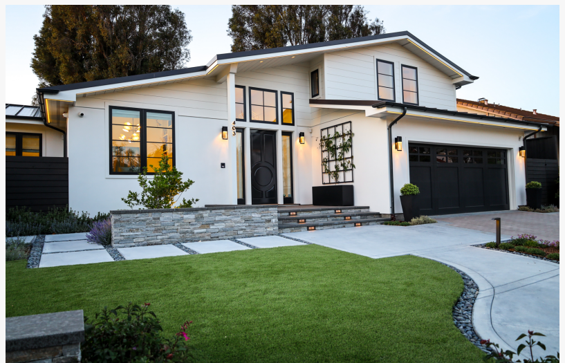
A contemporary front yard showcasing clean lines, dominant hardscape, and an emphasis on structural plantings.