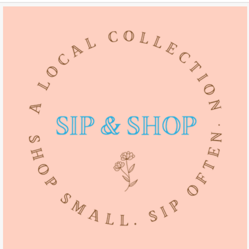
Sip & Shop: A Local Collection based in Gilbert, Arizona

About Desert Botanicals Founded in Arizona in 2019 by a Ph.D. Chemist from the University of Southern California and a University of Chicago M.B.A., Desert Botanicals is committed to socially responsible development of the highest quality and performance hair care