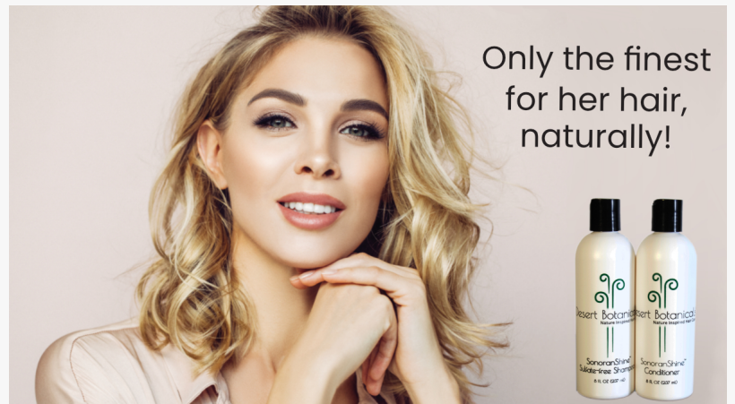
Desert Botanicals - Nature Inspired Hair Care provides a luxurious look and feel.