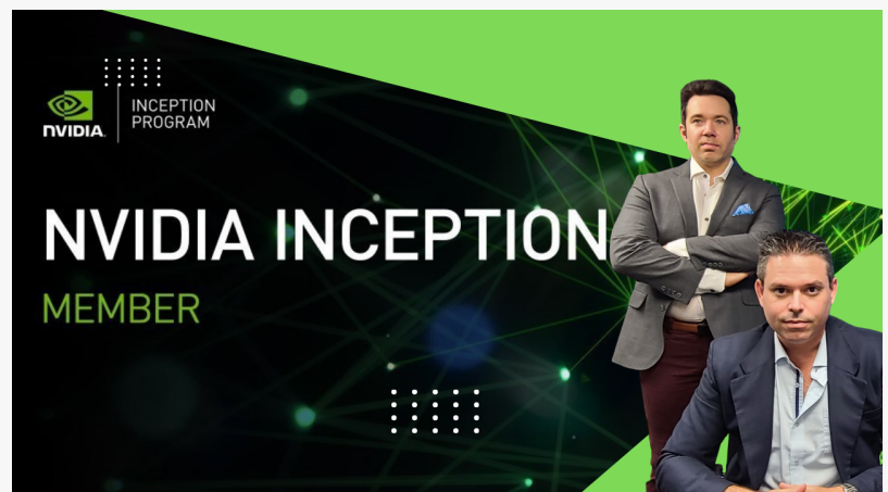
AI Exosphere NVIDIA Inception

This press release can be viewed online at: https://www.einpresswire.com/article/586326445