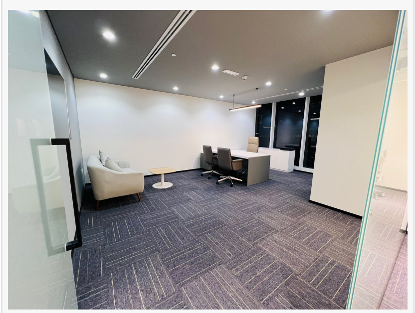
UnboundB2B Opens a New Office in Dubai

Our highly competent team is ready to serve our current clients and onboard new ones. I am honoured to be leading UnboundB2B's expansion to this region. This launch is a culmination of