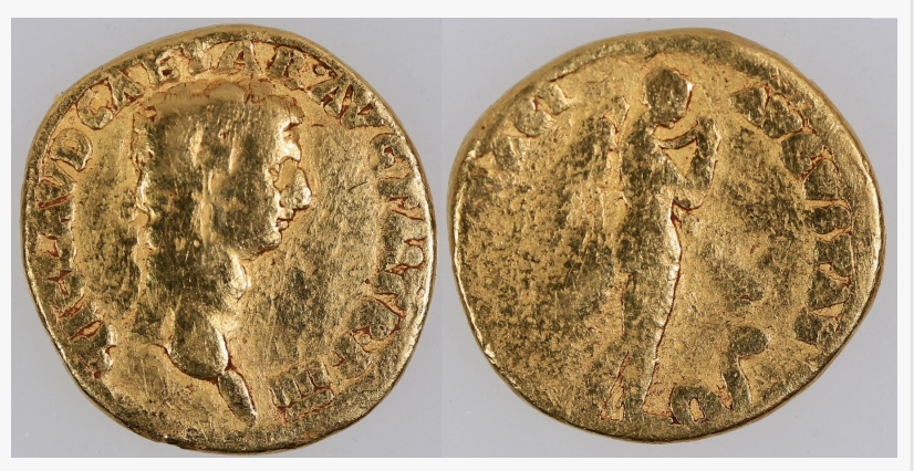
Very rare aureus (ancient Roman gold coin), depicting Claudius (AD 41-54), conqueror of Britain, and Pax as a winged nemesis driving the snake of good fortune (est. $3,000-$3,500).

Fabulous unlisted half-gallon Pioneer Bar & Bottling Works whiskey jug (Victor, Colorado) (est. $1,000-$2,000).