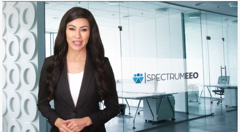
Spectrum EEO Professional Services

Opportunity Employment (EEO) related training, Federal sector EEO Investigations, and other