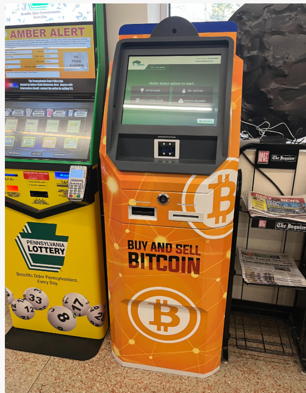
Bitcoin ATM at Gulf Countryside Food Mart & Deli