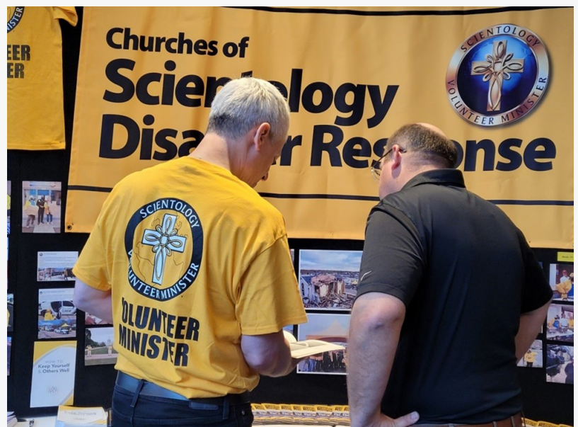
Churches of Scientology Disaster Response volunteer at the 2022 National VOAD annual conference in Baltimore, MD