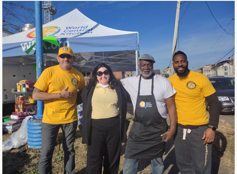
Churches of Scientology Disaster Response Volunteers partnering with World Central Kitchen, in Mayfield, KY

WASHINGTON, DC, USA, August 18, 2022 /EINPresswire.com/ -- Hundreds of natural disasters rage through the United States each year. The large ones are nationally declared by the President and smaller ones are declared by the governor of the affected state. Each one, no matter the size, devastates those impacted. Coming to their aid is a partnership of voluntary organizations working hand in hand with the Federal Emergency Management Agency (FEMA).