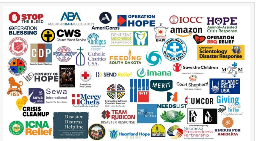
FEMA Partnership Month 2022 participating organizations

Tornado season now extends into December as experienced by communities hit by December