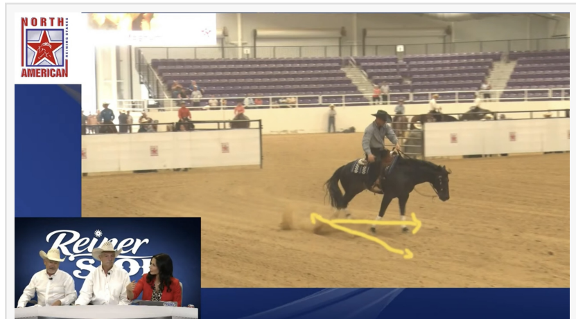
Show Time explains maneuver evaluation using graphics for visual clarity

"The Run For A Million is an exciting opportunity for our teams to come together and bring unparalleled access to industry insights, and continue our commitment to invest back into the