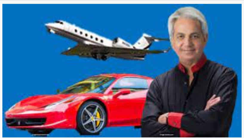
Doing God's Work Tax free