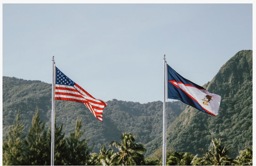
American Samoa Flags

Another excellent reason to start an LLC in American Samoa is the protections afforded to LLC members by its physical location. American Samoa is several hours' flight from Hawaii, which is itself already a 5-6 hour flight from Southern California. Suing an LLC based in American Samoa will require the other party's attorneys to make a court appearance in front of a judge in a court on American Samoan soil. The airfare alone will cost thousands of dollars, on top of court fees.