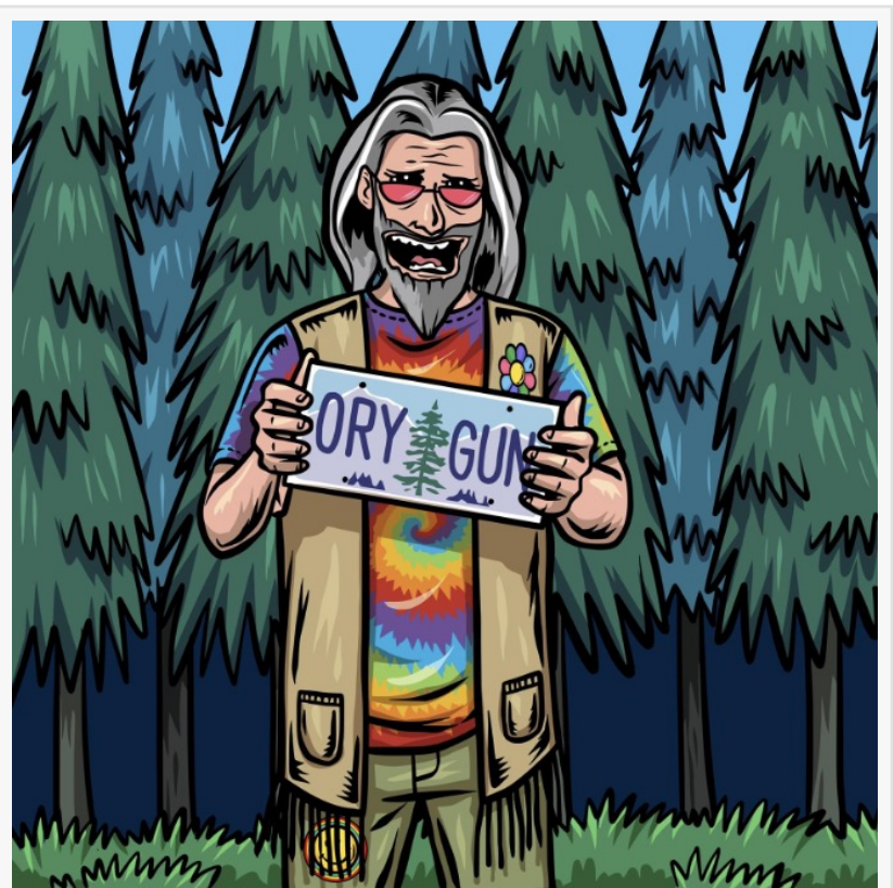
Uncle Arnie's Expands Into Oregon