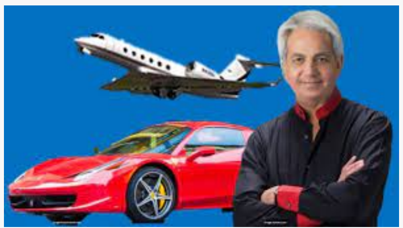
Doing God's Work Tax free