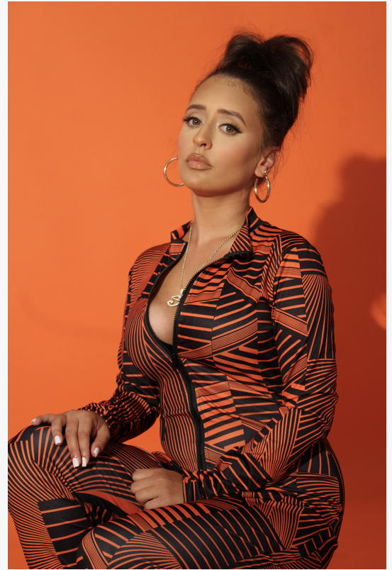
Apple or Orange, you decide.