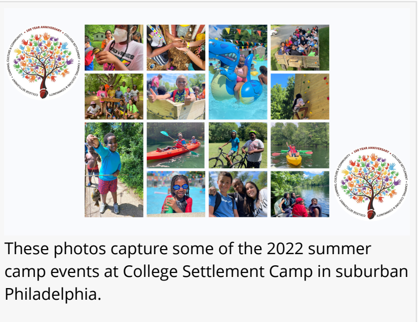
These photos capture some of the 2022 summer camp events at College Settlement Camp in suburban Philadelphia.