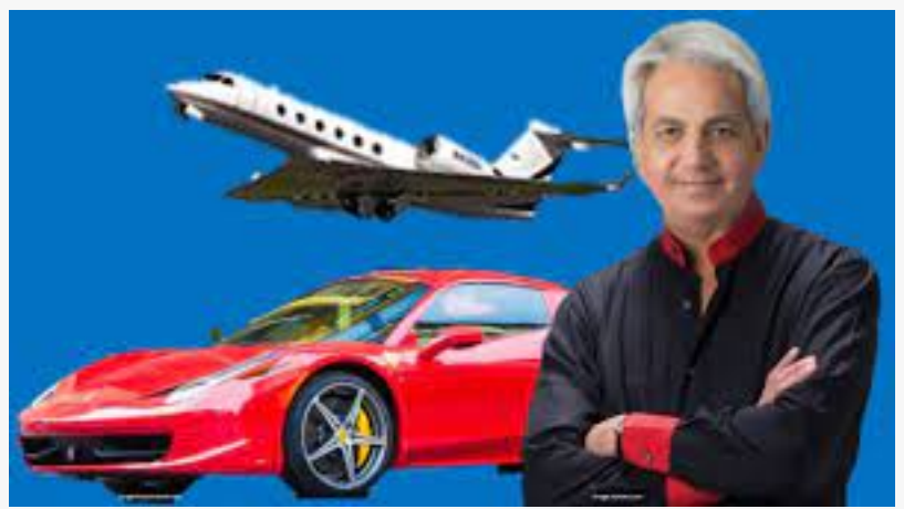
Doing God's Work Tax free

According to the U.S. Department of Education, 'most any high school student is sufficiently tech-