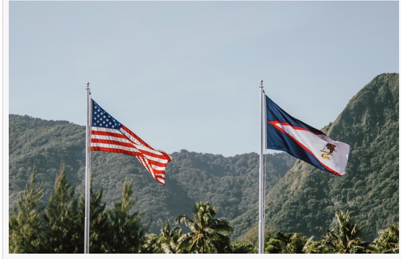
American Samoa Flags

Constitutional right to privacy. When an LLC is registered in American Samoa, the identities of the LLC owners remain anonymous to everyone except the Government. If a business doesn't want the world to know who is running a business an American Samoan LLC is a great choice. In todays digital world <u>LLC privacy</u> is key!