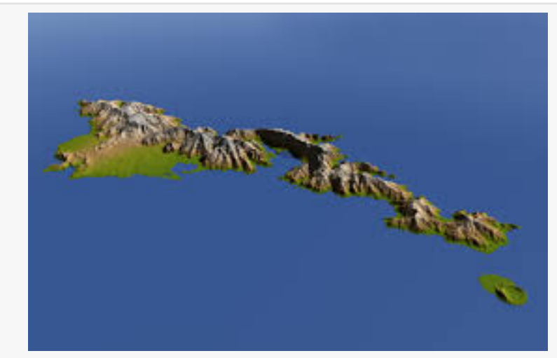
American Samoa USA

In today"s interconnected world, with an ever-expanding list of apps and services with nebulous and arbitrary Terms of Service, it can be easy to forget that individuals still have a