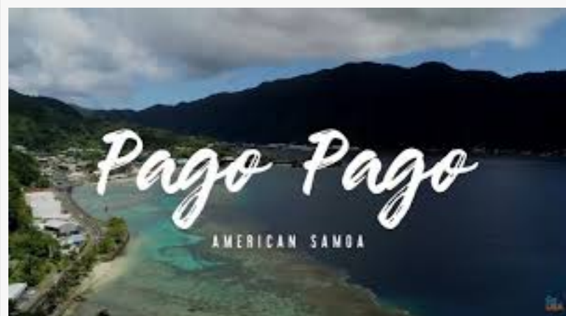
Pago Pago, American Samoa

A M E R I C A N S A M O A PACIFIC OCEAN Pago Pago Aunuu Tutuila MANUA ISLANDS Olesega map American Samoa