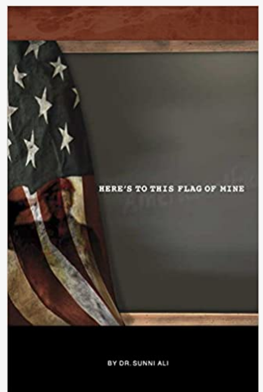
Here's To This Flag of Mine BY Sunni Ali

The book capsules the magnitude of Islam's influence in a compelling way that would force the reader to continue reading and learning about what truly happened and