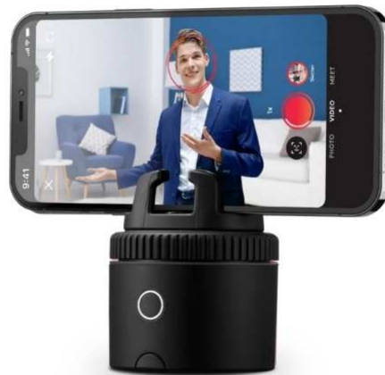
Pivo for Real Estate Pros

Using sophisticated computer vision, Pivo Pod is an important tool for any real estate professional who wants to create better virtual tours using their smartphone rather than relying on burdensome camera equipment or hiring expensive videographers.