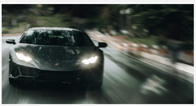
Albuquerque Expands Automated Speed Enforcement Program

ALBUQUERQUE, NEW MEXICO, UNITED STATES, August 24, 2022 /EINPresswire.com/ -- The <u>City of</u> <u>Albuquerque</u>, New Mexico continues to expand its <u>speed camera program</u> to encourage safe driving on dangerous roads throughout the City. NovoaGlobal<sup>®</sup> is working with City officials to install three additional advanced photo enforcement cameras where the most dangerous speeding occurs.