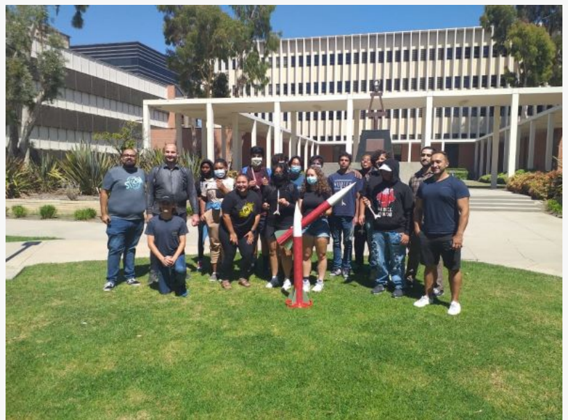
Aerospace team with rockets they designed and built.

This press release can be viewed online at: https://www.einpresswire.com/article/587277517