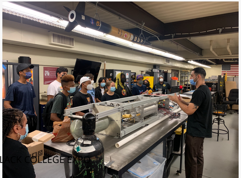
Students receiving hands-on training at camp.