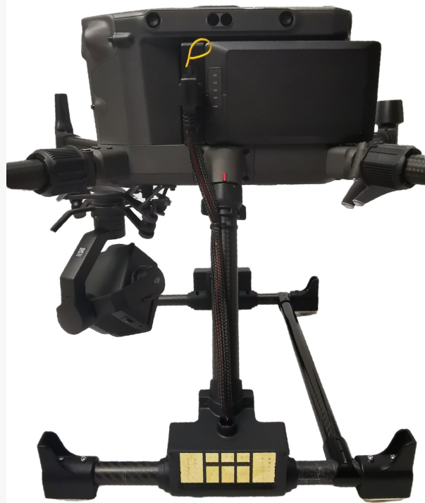
HEISHA retrofitted M300 landing gear

A technology-driven company, HEISHA Tech, is a leading drone and robots self-charging station brand. The company focuses on creating products with real value for daily life through advancing science and technology. With a