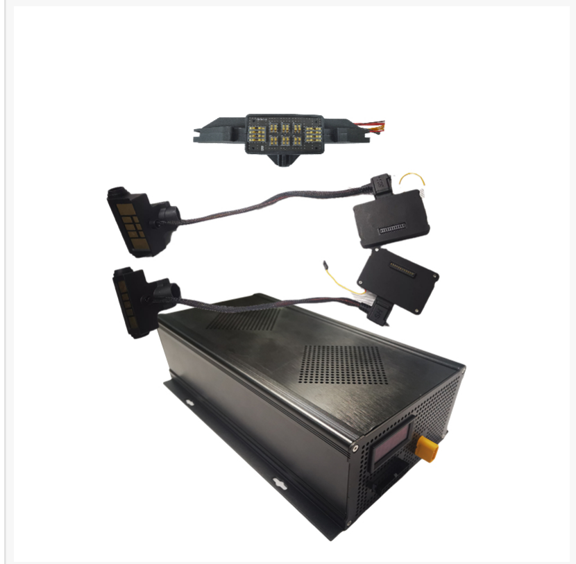
HEISHA Drone Battery Charging Kit