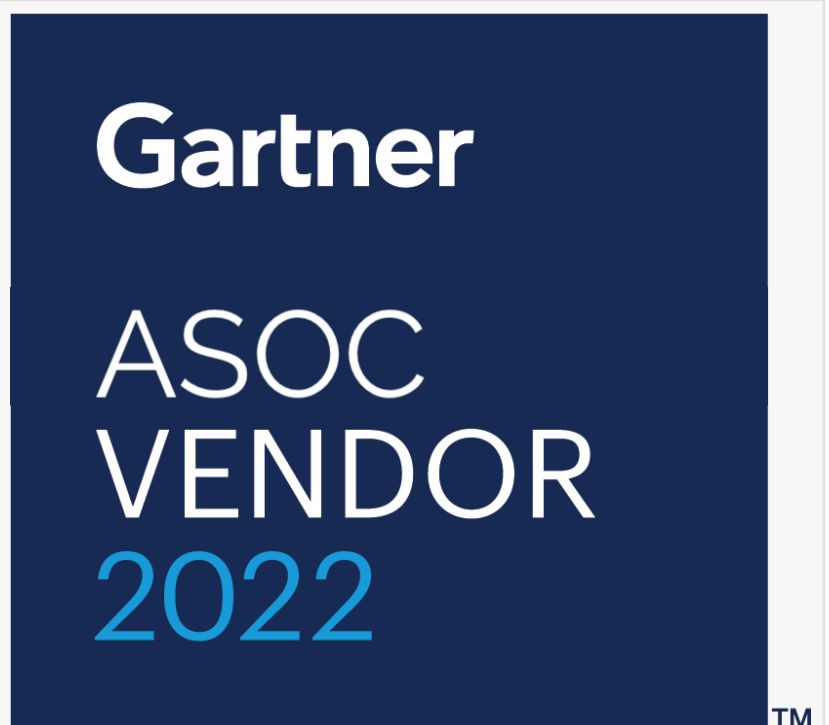
Gartner's most recent Hype Cycle for application security

AppSec Phoenix was established to provide an effective all-in-one security solution for application developers and businesses. With our easy-use platform, we've simplified a notoriously complex problem faced by many small and large companies working in finance and beyond. Learn more by visiting https://www.appsecphoenix.com/ .